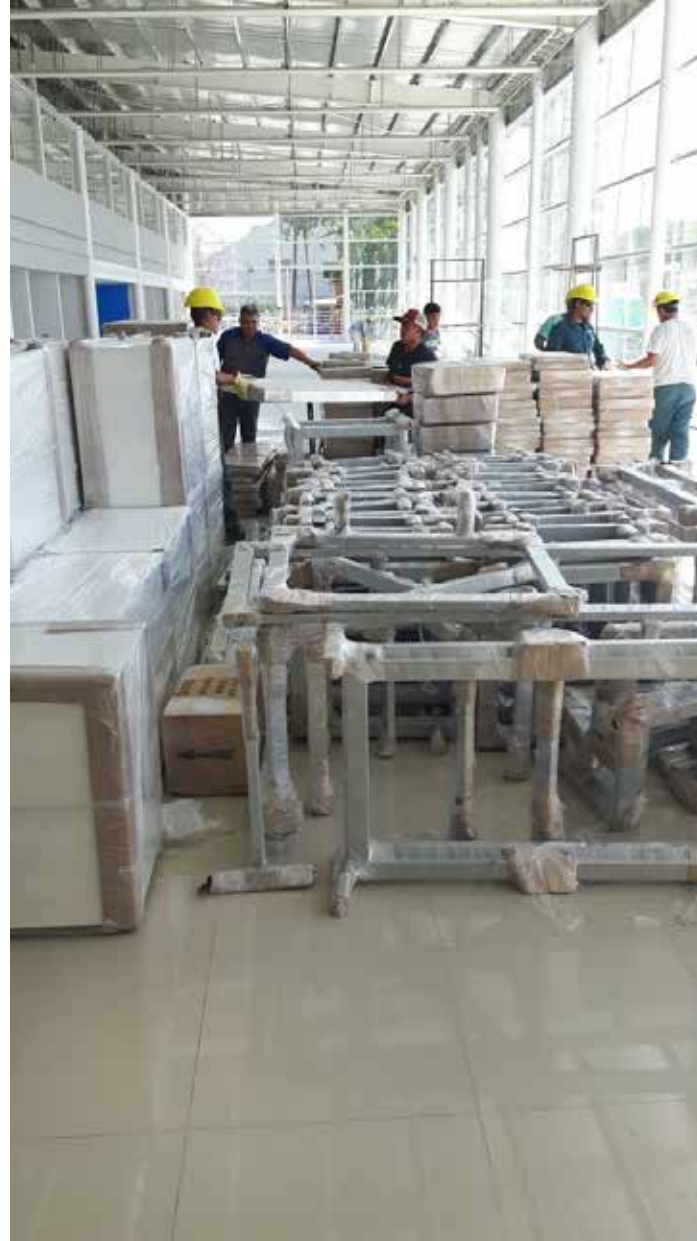
General Motors, Rosario.