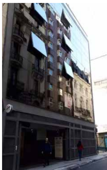
840 Tucumán Street Of. E, floor 1°. San Nicolás, CABA. 1007

Our office are located in the same place where the most famous writer in Argentina was born in 1899: Jorge Luis Borges